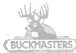
JERRY ZEPATOS FIELD EDITOR

300 Pelham Road • New Rochelle, NY 10805 (914) 632-2852